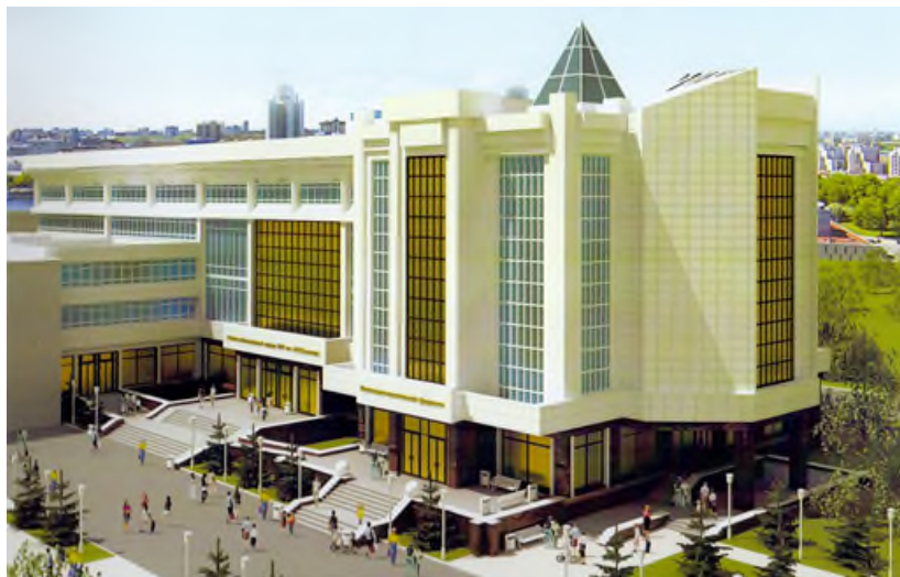
Figure 3: New building of the Architectural and Construction Faculty of L.N. Gumilev Eurasian National University, Astana, 2014. Design by Z. Malibekov.