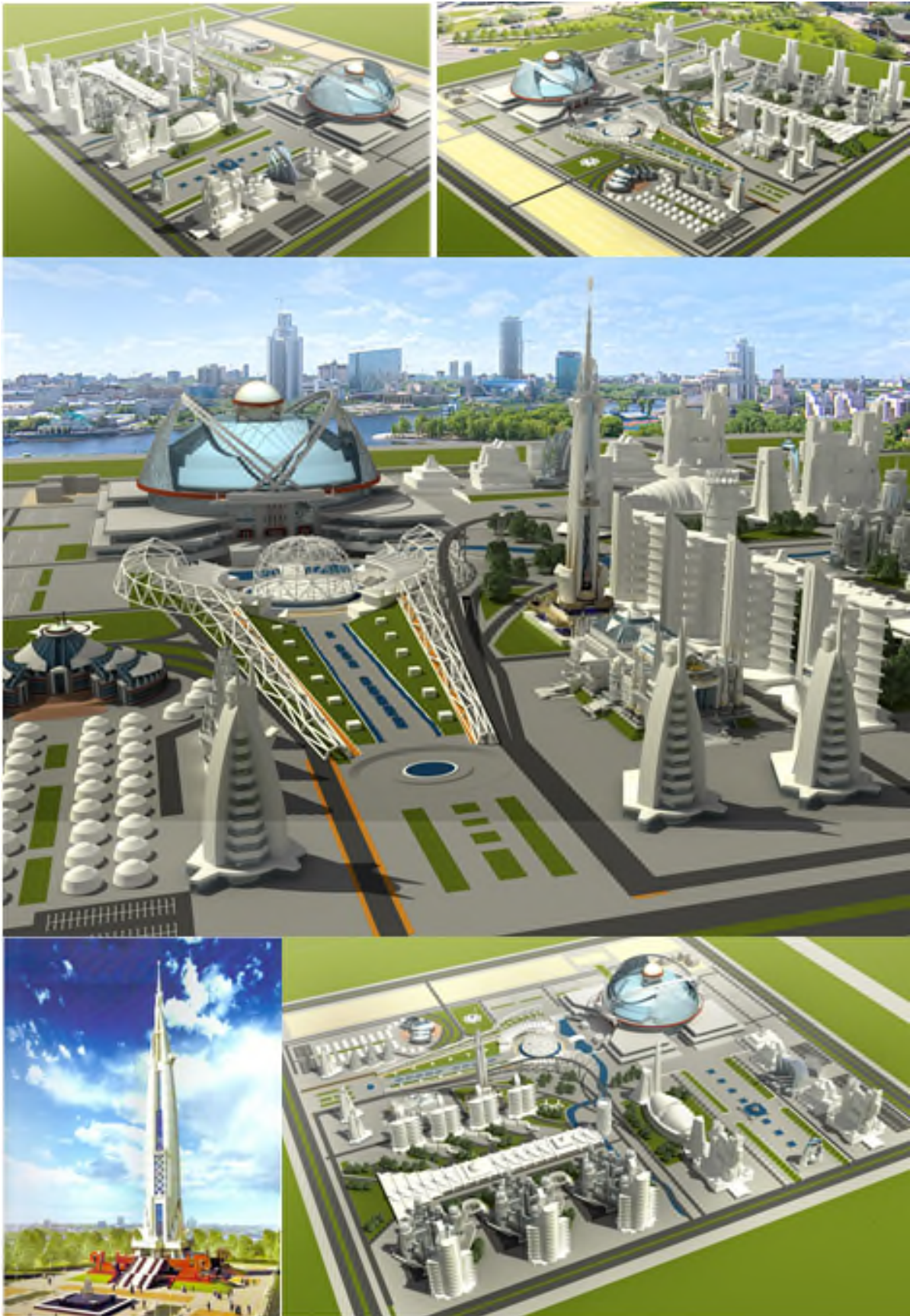
Figure 2: A project on a competition featuring the EXPO-2017 exhibition complex. Scientific Research Institute Etnoarkhitektura of L.N. Gumilev Eurasian National University, Kazorkenproyekt LLP. Head and author Z. Malibekov, Astana, 2013.

A competition for an exhibition complex was executed in regional national architecture style with elements of modern architecture, use of new materials and new technologies. The architectural expressiveness of buildings was achieved due to the use in volumes of the elements characteristic of the Kazakh folk applied art with structural elements of a yurta-kerege, a use of a national ornament (Figures 2, 3 and 4).