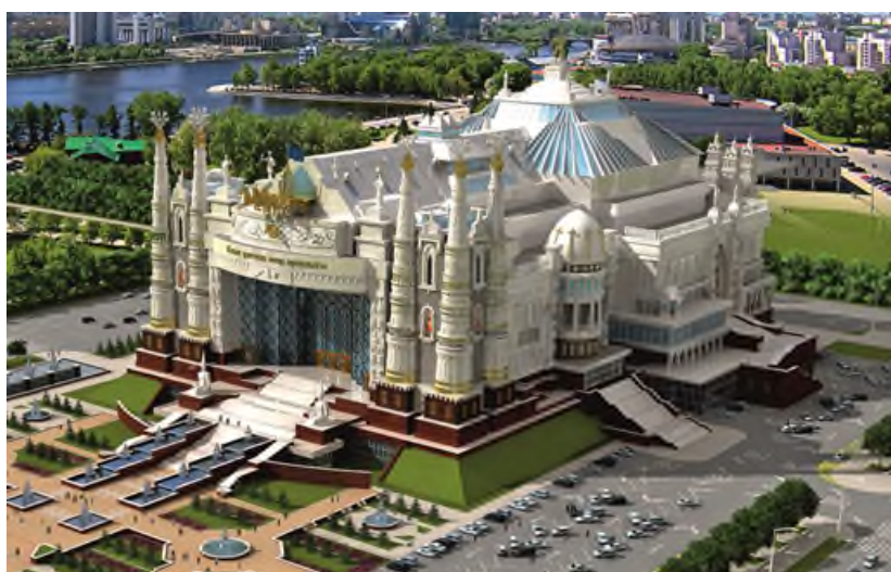
Figure 4: The project of the Cultural Centre as a competition, Astana, 2013. Designed by Z. Malibekov.

The spiritual support of the Oitegi architecture is national self-awareness, common sense and reason. Consciousness is a philosophical concept. It is both a phenomenon and a spiritual mirror seen in the influence of natural sensations and concepts, the life of the people, testament of the ancestors, coming from the old gray . A measure of customs and traditions have formed from ancient times. The concept of consciousness shows stability, labour, unity, peace, responsibility, exactingness and so on. The culture of the Great Steppe , in harmony with nature, makes it possible to preserve cultural values, extol them and continue. National consciousness is comprehended through national culture. The consciousness of independence shows freedom from subordination, becoming the master of freedom and liberty in the Great Steppe . Consequently, Oitegi is a property of the harmony of architecture with nature in the vast nature of the Great Steppe . The profound meaning of building art is the establishment and demonstration of interests of the steppe culture in space.